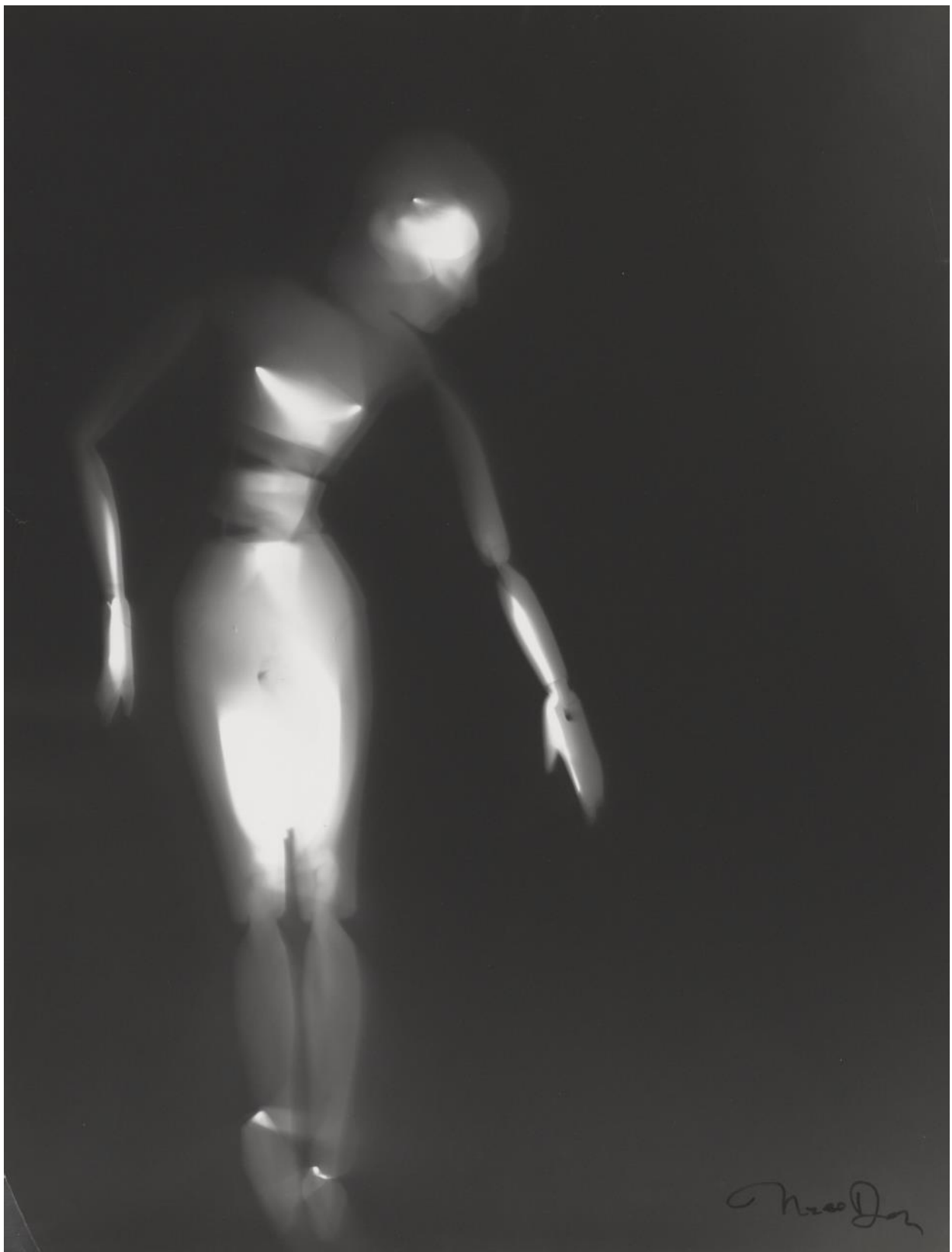
Nell Dorr (1893–1988) The Puppet Dances #7 , 1925–1970s Gelatin silver print

Amon Carter Museum of American Art, Fort Worth, Texas, Gift of the Estate of Nell Dorr © 1990 Amon Carter Museum of American Art P1990.45.284