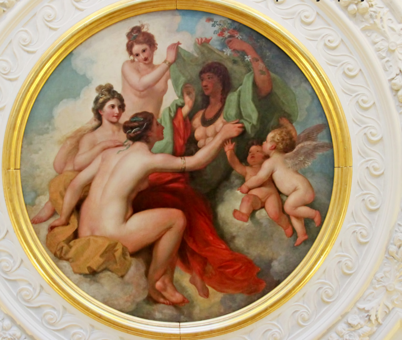
The Graces unveiling Nature by Benjamin West, Royal Academy of Arts, London, photo by Lep Reynolds