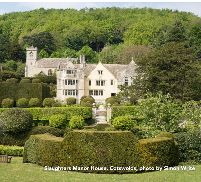
Slaughters Manor House, Cotswolds

DISCLAIMER: The itinerary is subject to change at the discretion of Arrangements Abroad. For complete details, please carefully read the terms and conditions at www.arrangementsabroad.com/terms .