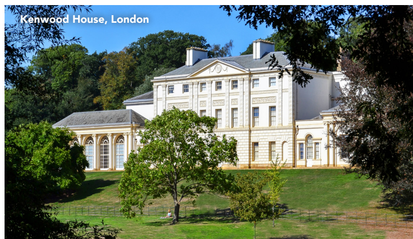
Kenwood House, London