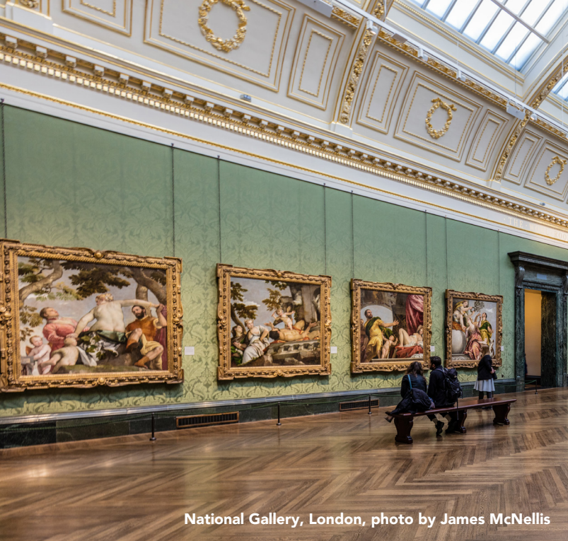
National Gallery, London